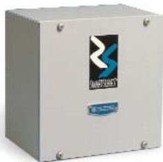
Indoor Speaker Amplifier