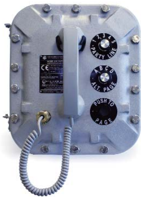
Outdoor and Explosionproof Station